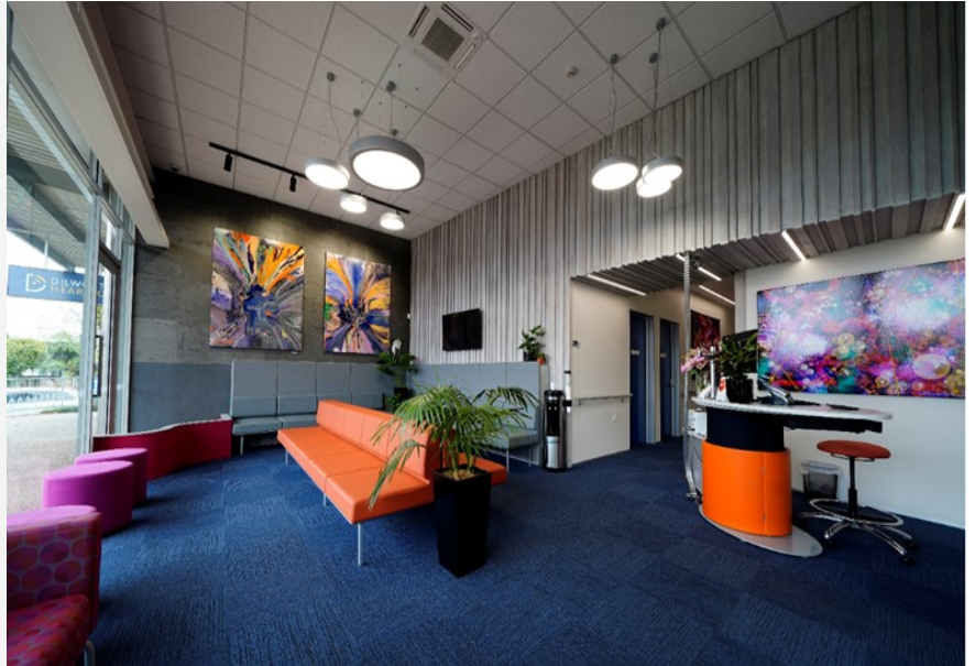
Our New Bethlehem Clinic

"Patients are at the heart of our practice, we are focused on delivering the highest quality of care supported by the latest technology in a modern environment"